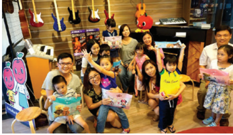
2 & 10 SEP 2016 ♡ Music Avenue Academy Electone Mini Concert at Music Avenue Academy