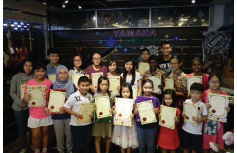
26 JUN 2016 ♡ Perfect Time Music Sdn Bhd Class Concert at Perfect Time Music Sdn Bhd