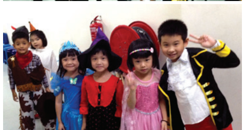
15 OCT 2016 ♡ Johor Bahru Music Centre Sdn Bhd Mini Concert at Johor Bahru Music Centre Sdn Bhd