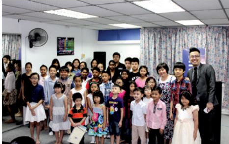
04 JUN 2016 ♡ Mega Music Academy Sdn Bhd Student Recital at Mega Music Academy Sdn Bhd