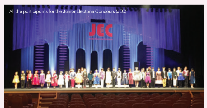
All the participants for the Junior Electone Concours (JEC)